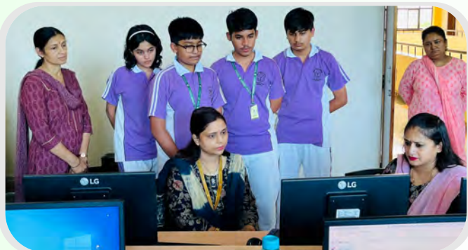
MOVIE MAKING COMPETITION