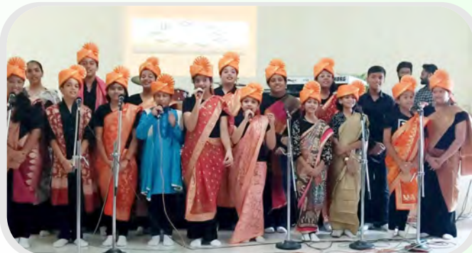
INSTRUMENTAL MUSIC & GROUP SONG COMPETITION