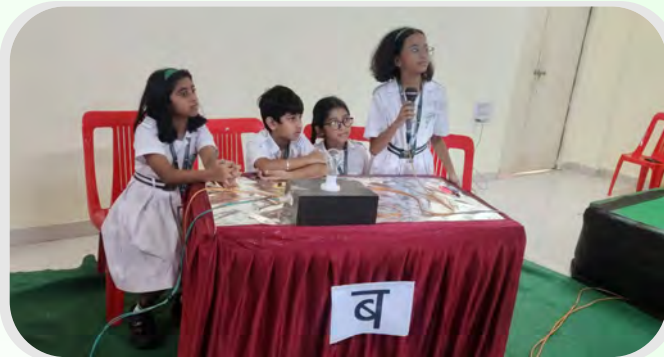
PRASHNA MANCH COMPETITION