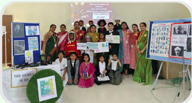
GENIUS IN ME COMPETITION