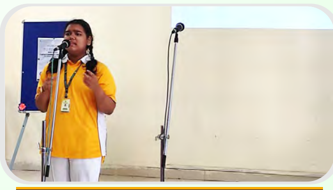
ENGLISH EXTEMPORE COMPETITION