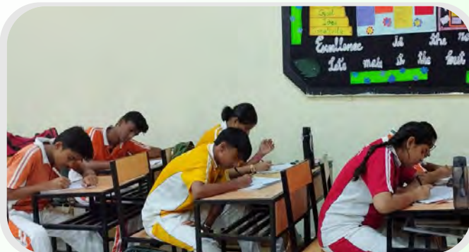
CREATIVE STORY WRITING COMPETITION